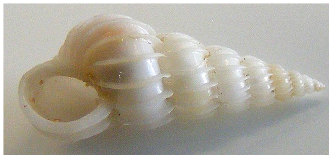
Interesting specimens observed during a club field trip to Toowoona Bay, North of Sydney.