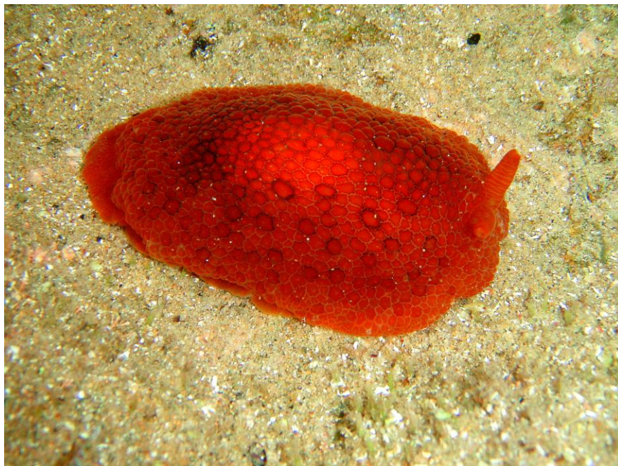
Jibbon BeachField Trip