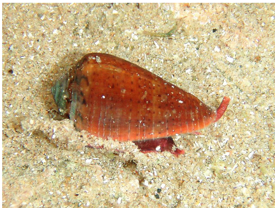
A stunning specimen of Conus Aplustre. during a club field trip to Jibbon Beach, Port Hacking, Sydney

To appreciate, understand and preserve shells and their environment and to share this with others.