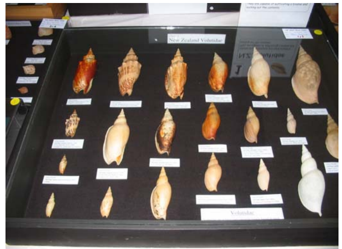
Shells from various other categories