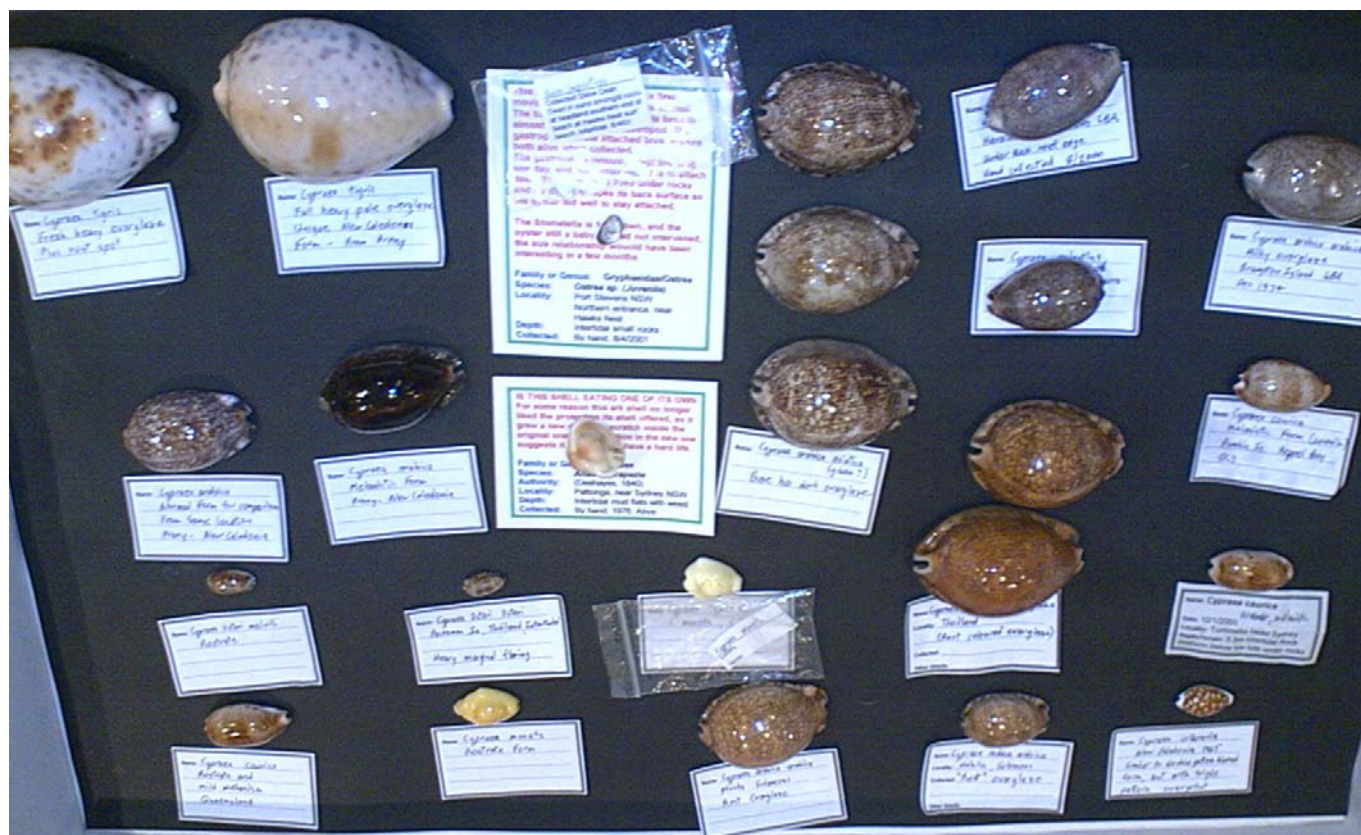
Members brought along Rostrate, Melanistic and freak shells: