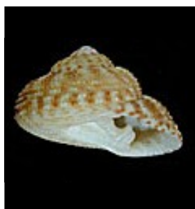
Clanculus floridus (Philippi, 1848)