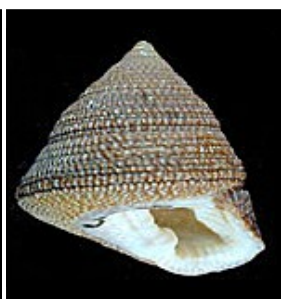
Clanculus maugeri (Wood, 1828)