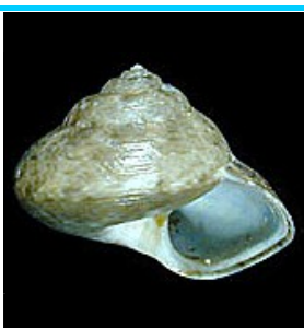
Talopena gloriola Iredale, 1929