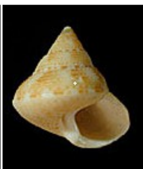
Astele scitulum (A. Adams, 1855)