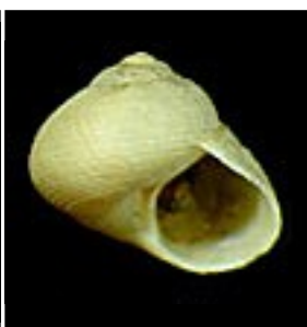
Austrocochlea porcata (A. Adams, 1853)