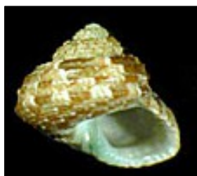
Eurotrochus strangei (A. Adams, 1853)