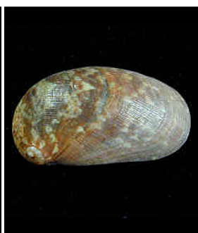
Stomatella impertusa (Burrows, 1815)