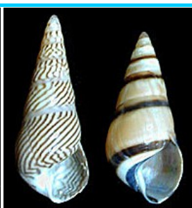
Bankivia fasciata (Menke, 1830)