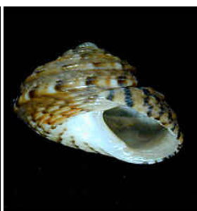
Clanculus plebejus (Philippi, 1851)