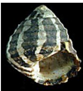
Nanula tasmanica (Petterd, 1879)