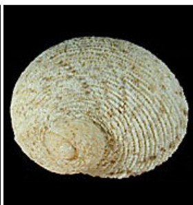
Granata imbricata (Lamarck, 1822)