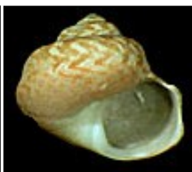
Notogibbula bicarinata (A. Adams, 1854)