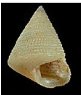
Calliostoma comptum (A. Adams, 1854)