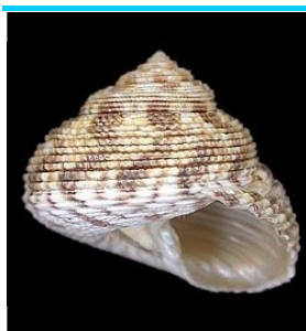
Monilea callifera (juvenile) (Lamarck, 1822)