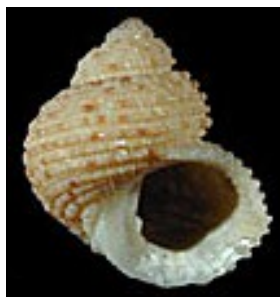
Herpetopoma aspersa (Philippi, 1846)