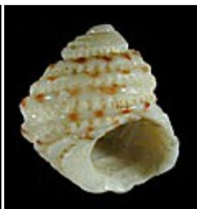
Euchelus ampullus (Tate, 1893)