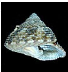
Clanculus brunneus A.Adams, 1853