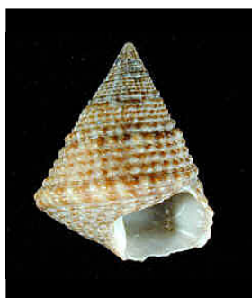
Calthalotia fragum (Philippi, 1848)