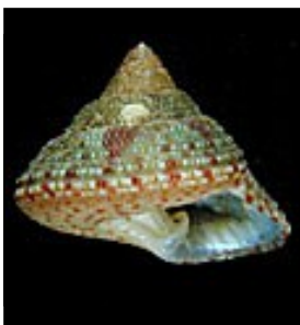
Clanculus clangulus (Wood, 1828)