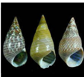
Phasianotrochus eximius (Perry, 1811)