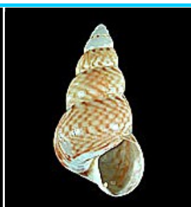
Leiopyrga lineolaris (Gould, 1861)