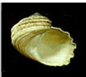
Fossarina patula A. Adams & Angas, 1863