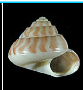
Spectamen bellulum (Angas, 1869)