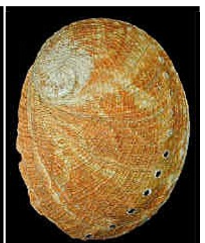
Haliotis rubra Leach, 1814