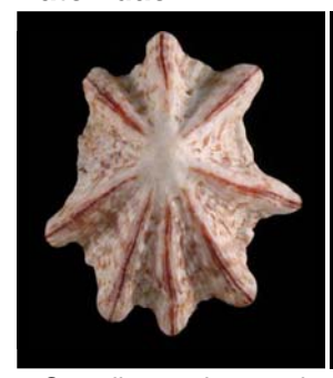
Scutellastra chapmani (TenisonWoods, 1876)