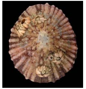
Cellana tramoserica (Holten, 1802)