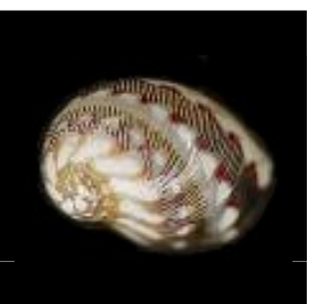
Smaragdia souverbiana (Gassies, 1861)