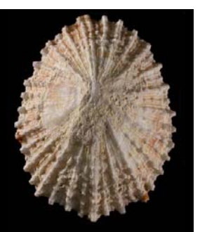
Scutellastra peronii (Blainville, 1825)