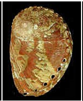
Haliotis coccoradiata Reeve, 1846