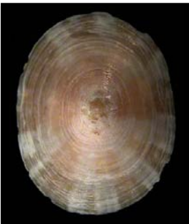
Asteracmea illibrata (Verco, 1906)