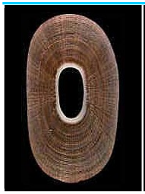
Amblychilepas nigrita (Sowerby, 1834)