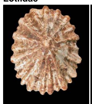
Patelloida alticostata (Angas, 1865)