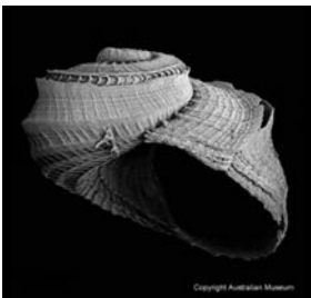
Sukashitrochus atkinsoni (Tenison Woods, 1877)