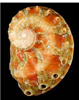
Haliotis brazieri Angas, 1859