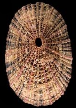
Diodora lineata Sowerby, 1835