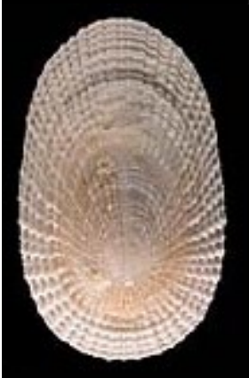
Tugali parmophoidea (Quoy & Gaimard, 1834)