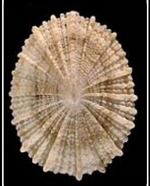
Montfortula rugosa (Quoy & Gaimard, 1846)