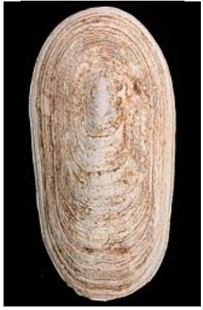
Scutus antipodes Montfort, 1810