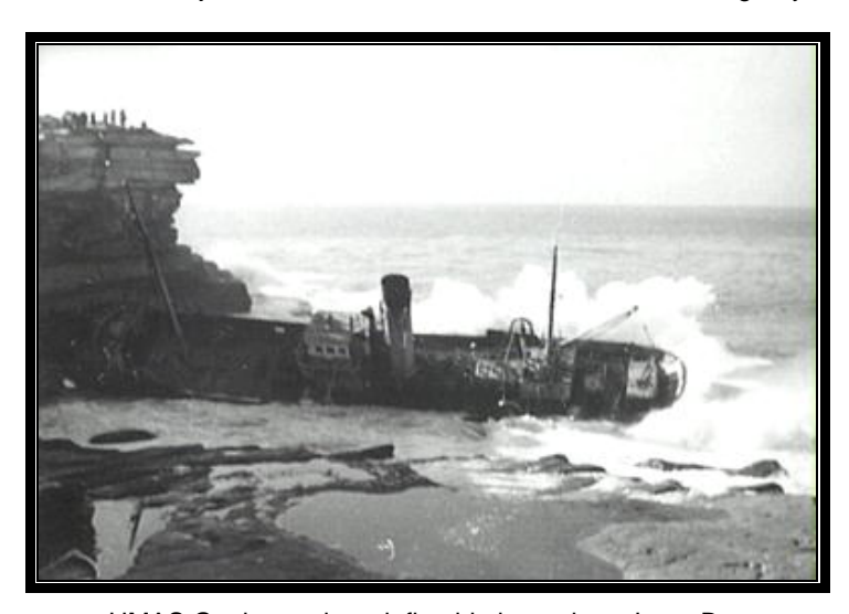
HMAS Goolgwa where it first hit the rocks at Long Bay

Both of these wrecks are now dive sites within Long Bay, and no doubt provide habitat for some of the species found washed up in our club's 12 month study around Long Bays' foreshores. All the species found are listed in upcoming Sheller issues.