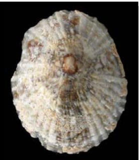
Patelloida mufria (Hedley, 1915)