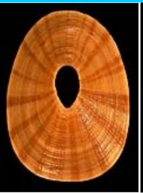
Amblychilepas javanicensis (Lamarck, 1822)