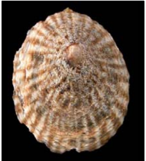
Notoacmea petterdi (Tenison Woods, 1876)