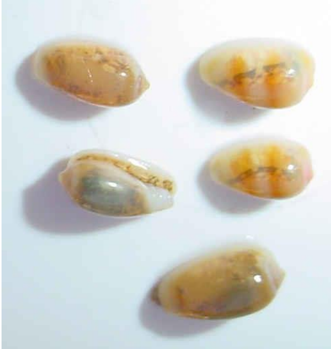
All 5 Margins alive, species yet to be identified (Two specimens have orange bands)