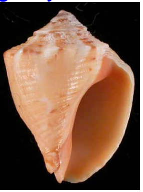
Pinaxia versicolor (Long Bay Sydney)