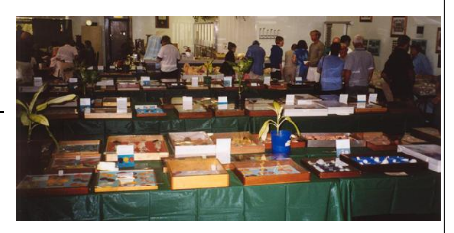
Townsville Shell Show 2001