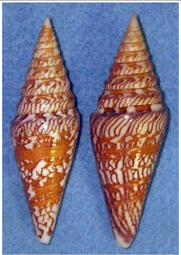
Excelsus, Philippines, Balute Is, 80.6mm, 83.3mm