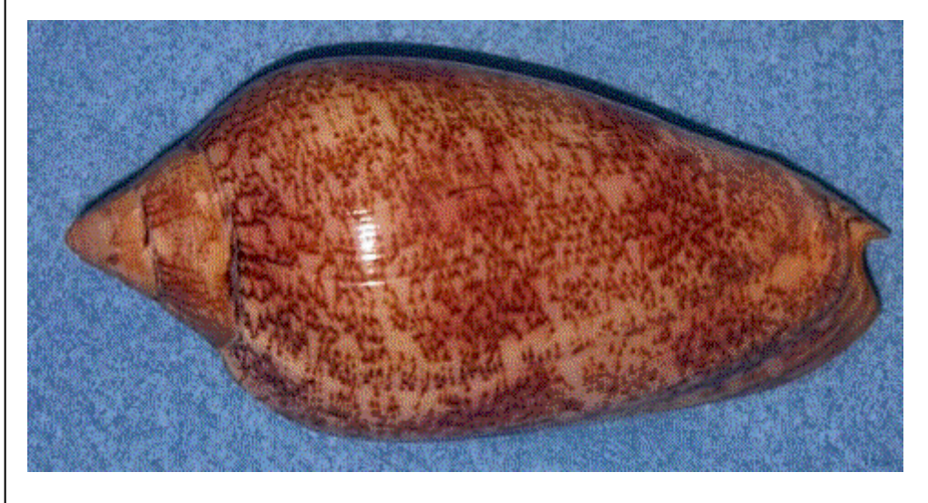
Amoria exoptanda, Port Lincoln, Sth Aust, 105mm

Neptune Seashells 1246 Firethorn St. San Diego, CA. 92154 Phone or Fax (619) 662-2773 shellman@home.com