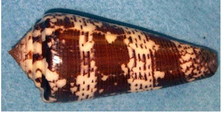
Thomae, Philippines, Cebu, 71.5mm