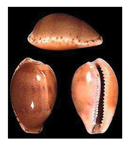
Cypraea piperita Gray, 1825